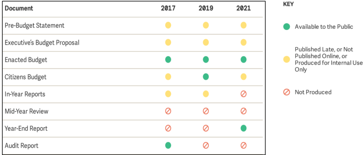
Figure 2: Public availability of budget documents in Burundi

The Burundian public sector and its financial management systems lack basic transparency. There has been some modernisation of digital infrastructure to boost transparency and the availability of data. However, progress in public financial management and budget transparency remains slow, driven primarily by investments from international partners such as the World Bank (World Bank 2024a). According to the Open Budget Survey (OBS) 2021, Burundi ranks at 108 out of 120 countries assessed in the last survey. Civil society and public engagement in budgetary allocations at any level are close to non-existent. Many key documents such as audit reports or financial statements by the state-owned enterprises are not produced or disclosed to the public (OBS 2021; UNCAC Coalition 2023).